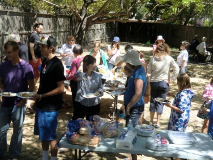
Neighbors eating and chatting at the Pool Party